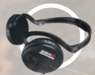
WSA II Headphones