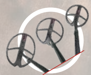
FMF® Coils 34/28 - 28 - 22