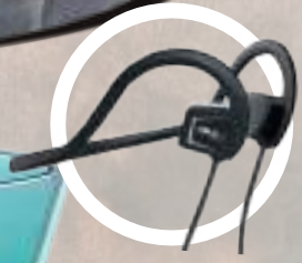
BH-01 Bone conduction headphones