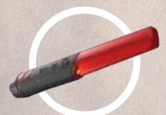
Pinpointer MI-6 connected