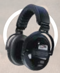
WSA II XL Headphones